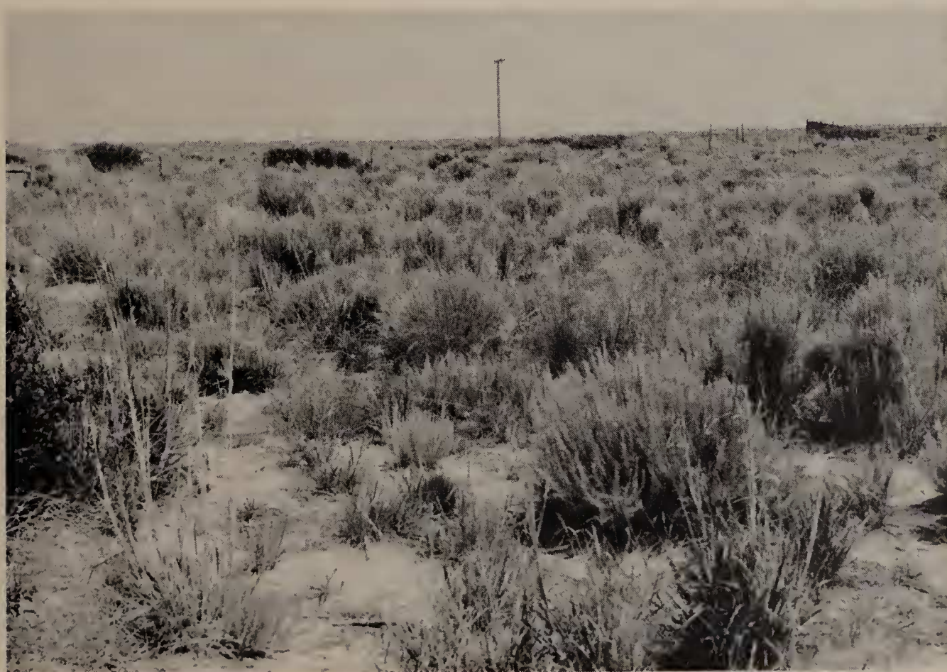
FIG. 7.—Sand sage-midgrass community, southwest of Muleshoe, Bailey County.